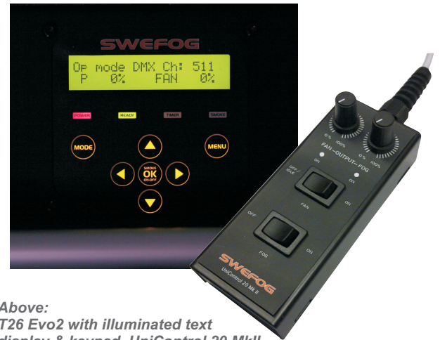
Above: T26 Evo2 with illuminated text display & keypad. UniControl 20 MkII manual hand-held remote control (optional accessory) .